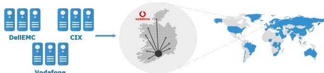
Fig. 1. INFINITE testbed

In this paper, we investigate the practical applicability of the distributed shuffle index within a real-world industrial environment. The shuffle index has been then implemented and